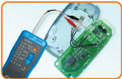
test positive and negative pole of DC electric level

Push DIP switch on emitter to position of “SCAN” , press function switchover button on emitter for 2 seconds, “STATUS” indicator will turn off and “VERIFY” indicator flashes, insert the crystal plug of crocodile clamp into RJ11, clamp the two ends of cable with crocodile clamps, in case that “STATUS” indicator lights up in red , it means the end clamped by red clamp is positive pole, in case that “STATUS” indicator lights up in green, it means the end clamped by red clamp is negative pole, electric level can be judged by brightness of the status indicators; the lighter the indicator, the higher the level is; the darker, the lower.